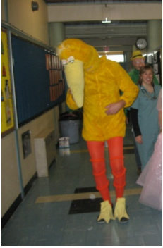
Halloween was an exciting day for all!!